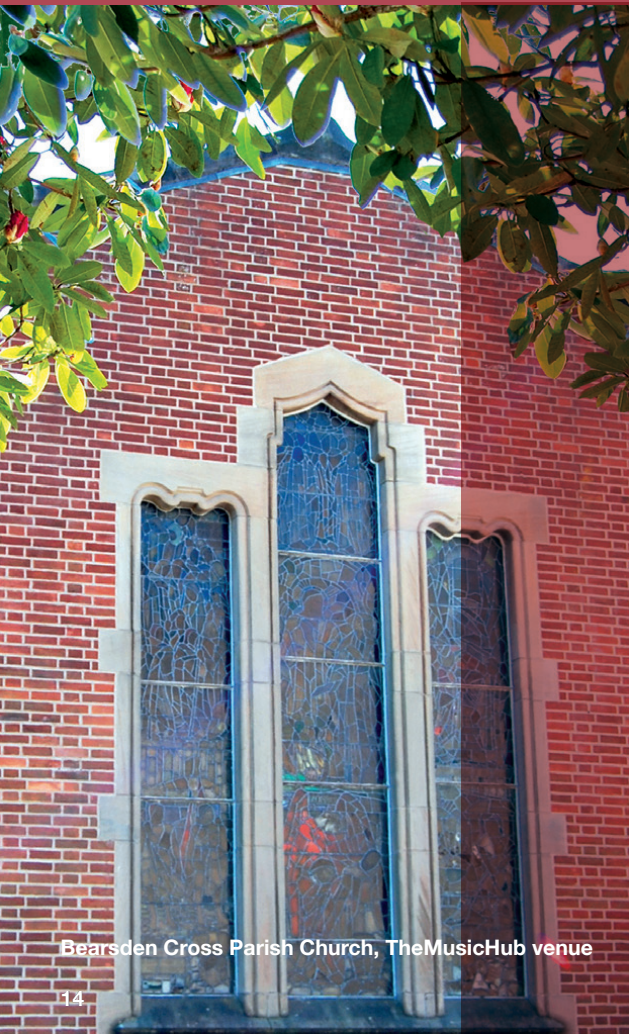
Bearsden Cross Parish Church, TheMusicHub venue